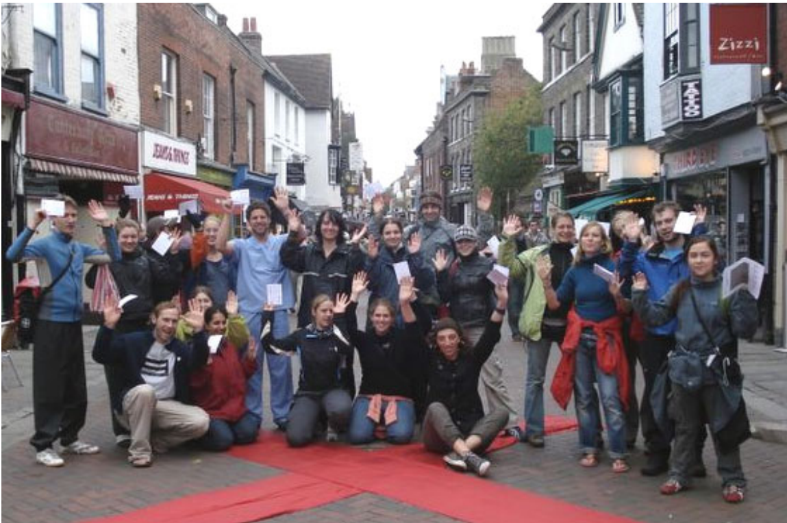
The Nobel Peace Organization International Physicians for the Prevention of Nuclear

The reason for this tour was the decision of the British parliament to renew their nuclear weapons program. Total expenses in the next thirty years including production, transport, security and maintenance of nuclear weapons will likely reach up to £70 billion . As doctors and medical students, we felt that this money would be better spent on education, health care, meeting development targets and improving social security. According to the World Court, nuclear weapons are illegal weapons of mass destruction. They are targeted primarily at the civilian population, at cities and are not to be used again after the horrible effects of the bombing of Hiroshima and Nagasaki. However, Britain is maintaining its 200 nuclear warheads, patrolling the world seas on its four vanguard submarines - each one with more firepower than hundreds of Hiroshima bombs .