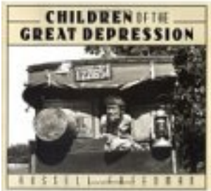
Children of the Great Depression by Russell Freedman